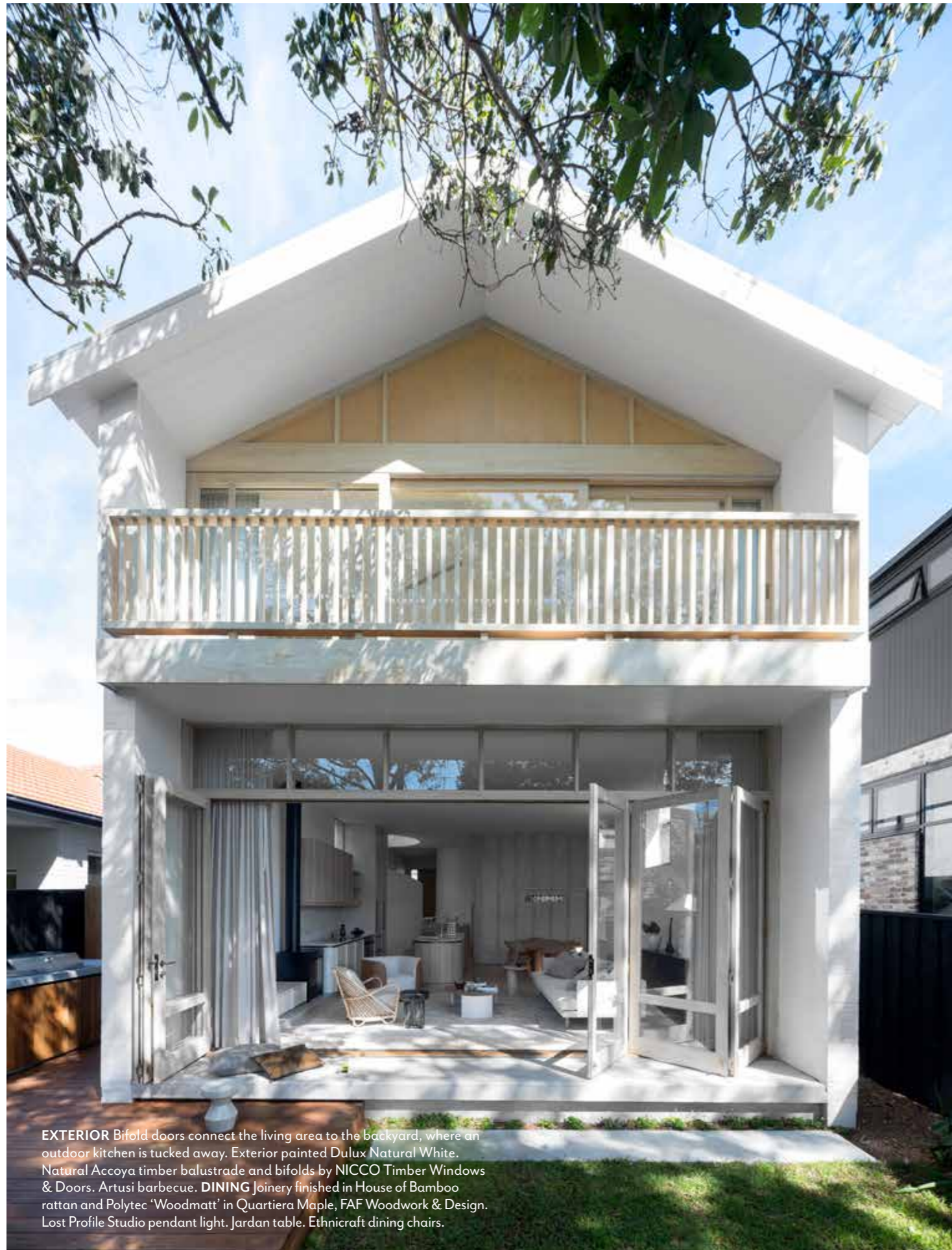
EXTERIOR Bifold doors connect the living area to the backyard, where an outdoor kitchen is tucked away. Exterior painted Dulux Natural White. Natural Accoya timber balustrade and bifolds by NICCO Timber Windows & Doors. Artusi barbecue. DINING Joinery finished in House of Bamboo rattan and Polytec 'Woodmatt' in Quartiera Maple, FAF Woodwork & Design. Lost Profile Studio pendant light. Jardan table. Ethnicraft dining chairs.