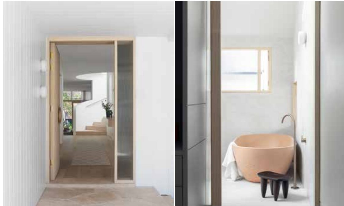
ENTRY James Hardie 'Scyon' cladding in Axon painted Dulux Natural White. Eco Outdoor 'Scala' crazy paving. ADesignStudio 'FlatWhite W2' wall lights. Viridian reeded glass. ENSUITE Top right Concrete Nation bath. Brodware 'City Plus' spout in Roma Bronze. Unique Travertine tiles in White Minimal Naturale, Di Lorenzo. 'Senufo' stool, Orient House. POWDER ROOM Bottom left Mirror and brass shelf, FAF Woodwork & Design. 'Cottage' tiles in Sand, Di Lorenzo. Concrete Nation basin. Brodware tapware. MAIN BEDROOM Below and opposite Wall lights and lamp, Lighting Collective. Sika Design 'Fox' lounge chair, Domo. Wendelbo 'Mate' side table and 'Casey' chair, Trit House. GlobeWest 'Hugo Ridge' bedhead. Cultiver bed linen in Sand. A Small Painting Concerning Time by Morgan Stokes, Curatorial+Co. Cushion, Montmartre Store. CHILD'S BEDROOM Polytec joinery in Nouveau Grey. In The Sac coverlet. Side table, Montmartre Store. Stacks On sculpture by Alichia van Rhijn, and Lilac Habitat II sculpture by Natalie Rosin, both Curatorial+Co. Curtains, Homelife Furnishings. Bremworth 'Samurai' carpet in Pyua.